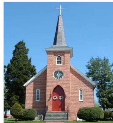
Saint Rose of Lima Church