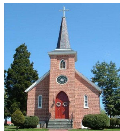
Saint Rose of Lima Church