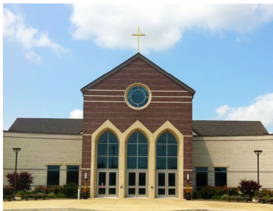
Saint Joseph Church

371 East Main Street Middletown, Delaware