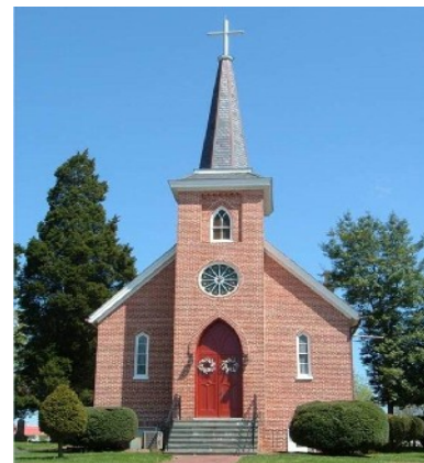
Saint Rose of Lima Church